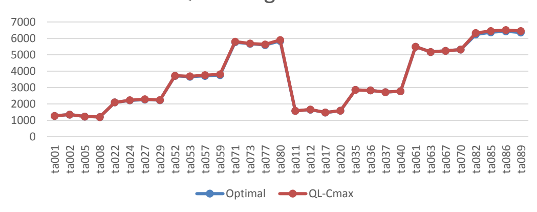
Figure 2. Q-Learning Precision

Of the previous figure, we can conclude that the accuracy and quality of obtained results by our approach are comparable to the optimum values proposed by the literature.